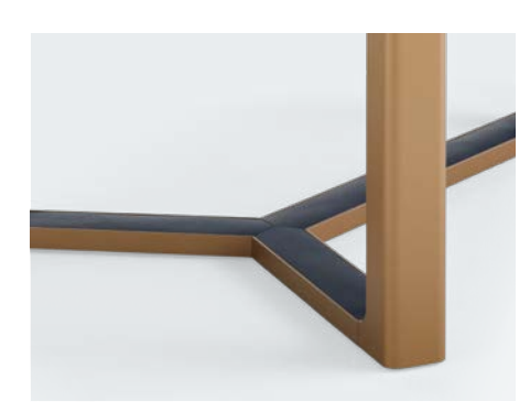
FORBO INLAYS Power cords can be tucked into the metal leg and hidden by a metal inlay.