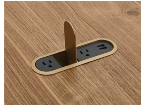
CC GROMMET Available in combinations of power, USB A and USB C, single or stacked.