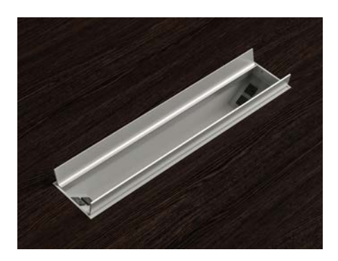
LONG METAL GROMMET Available in standard power with data knockouts only.