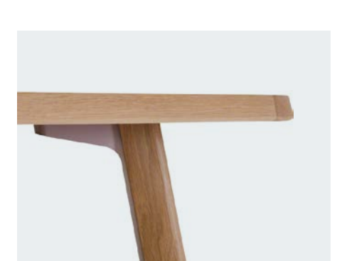
BRACKETS Leveling is fine-tuned in the bracket that attaches the top of the leg to the table surface.