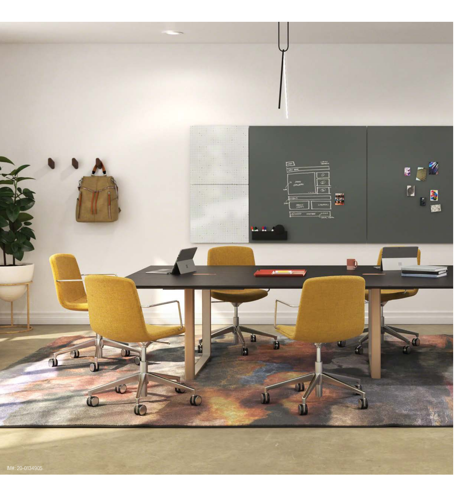
Verlay collaborative tables