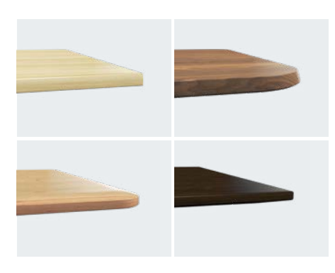
EDGE PROFILES Available in 3mm plastic and veneer with thin, drop, eased and slice edge options.