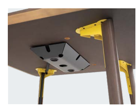
CORD MANAGEMENT TRAY Easy to use and access, this tray hides cords in a clean and functional way.